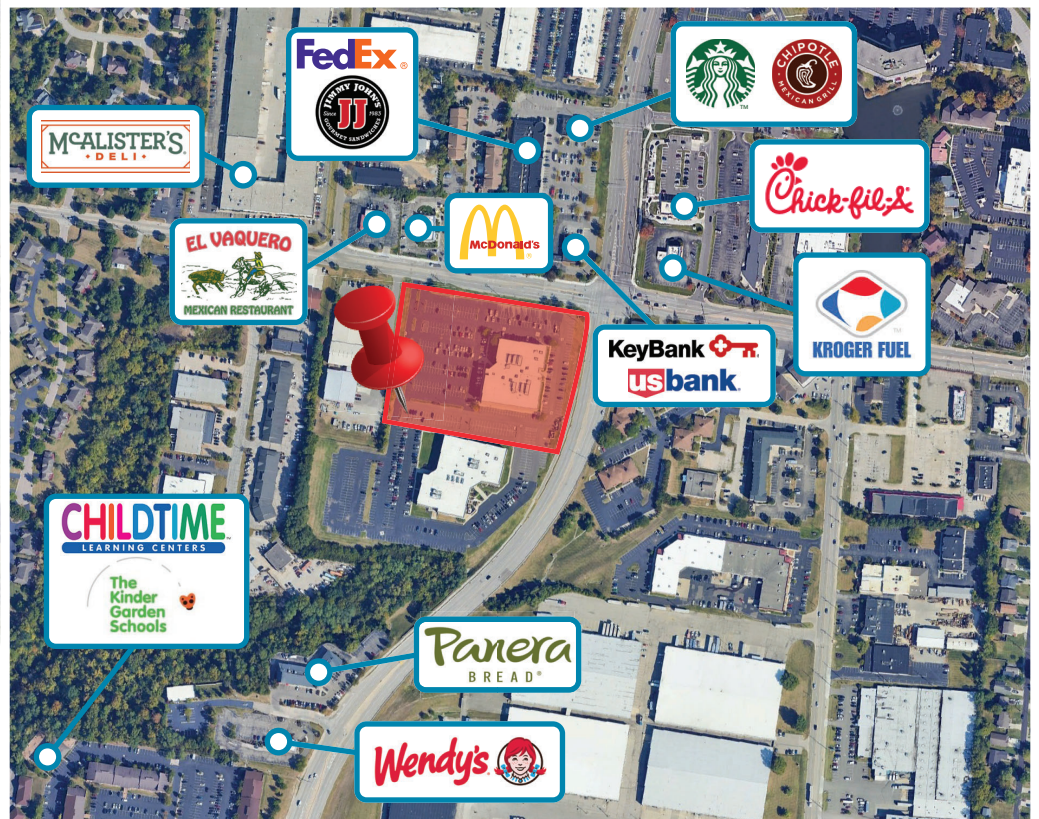
Amenities within 1 mile