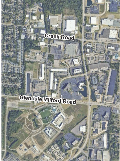
Blue Ash Overall