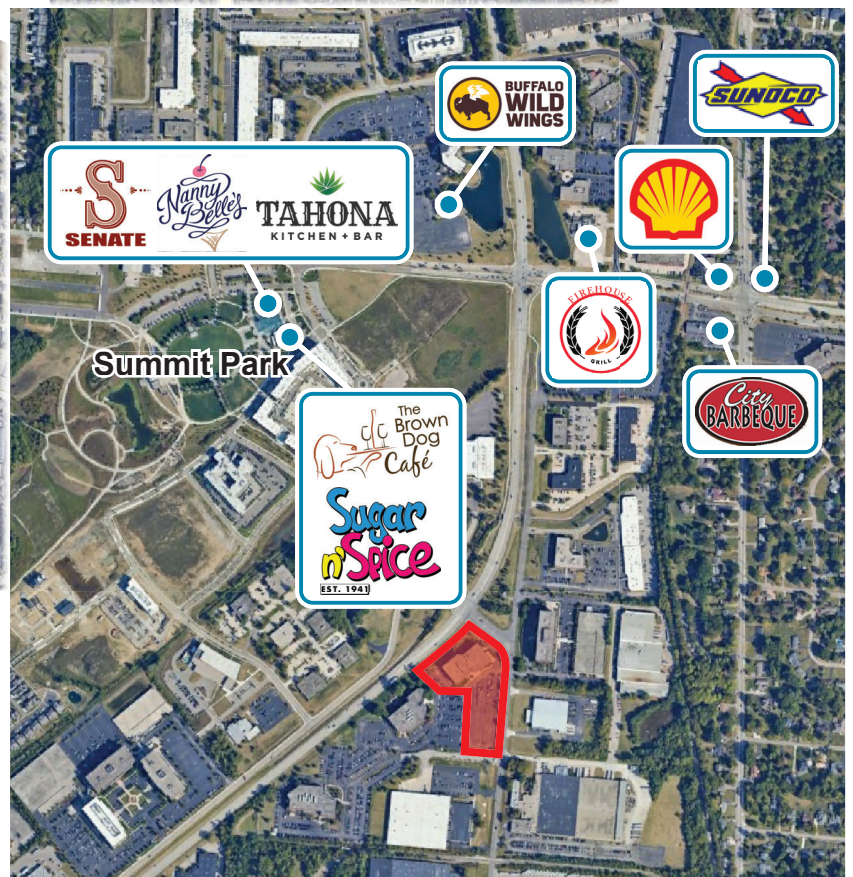
Blue Ash Overall