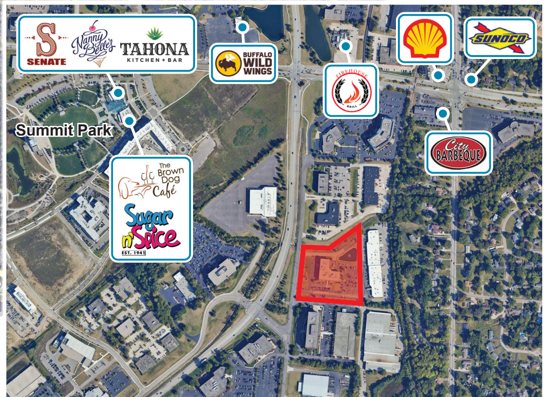
Amenities within 1 mile