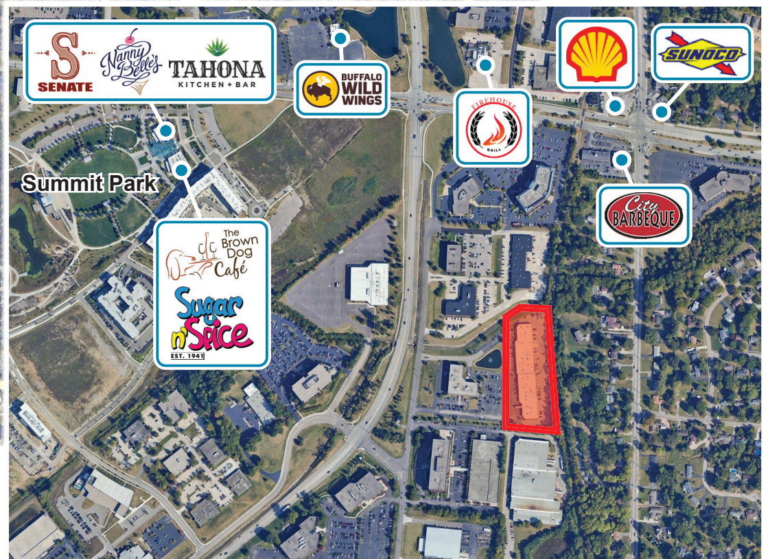
Amenities within 1 mile