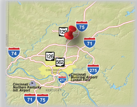
West Chester Retail Submarket