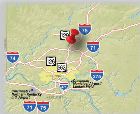
West Chester Retail Submarket